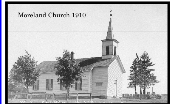
Moreland Church 1910

The society is organized exclusively for charitable and educational purposes - more specifically to procure, preserve and promote important historical documents, artifacts and information relative to the greater Moreland community area, situated in Franklin Township, Wayne County, Ohio.